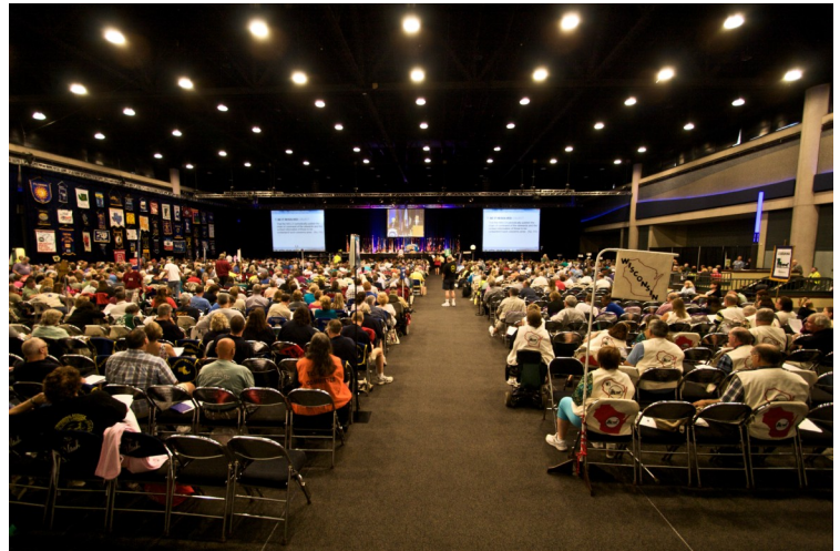
Picture from back of the room of a general session.