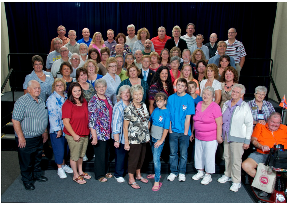
State of Ohio attendees at National Convention in Buffalo, New York.